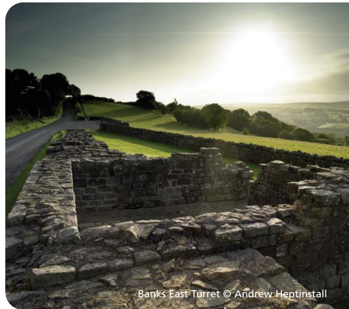
Banks East Turret

Accommodation and other tourism businesses in this guide are laid out in a clear fashion: