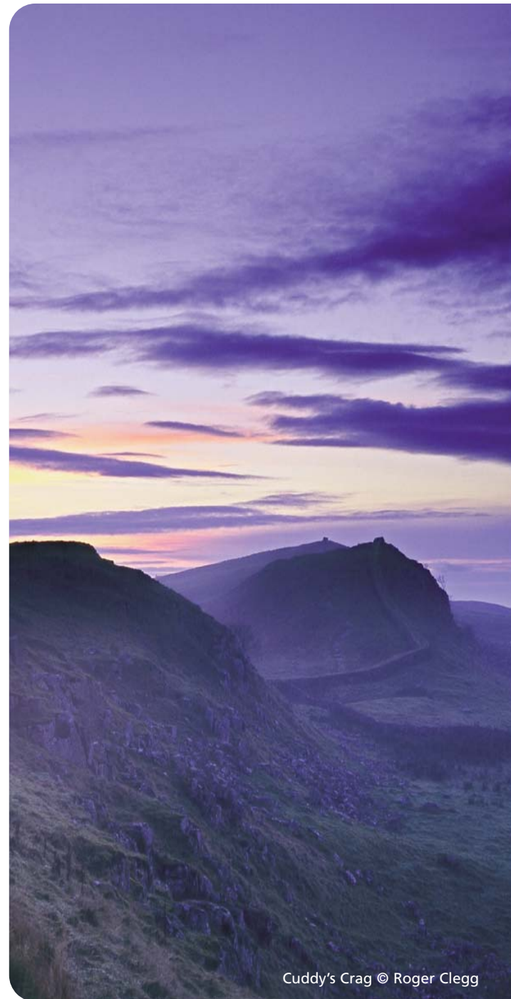
Cuddy's Crag

Go on – choose where you will stay. And discover amazing stories to tell.