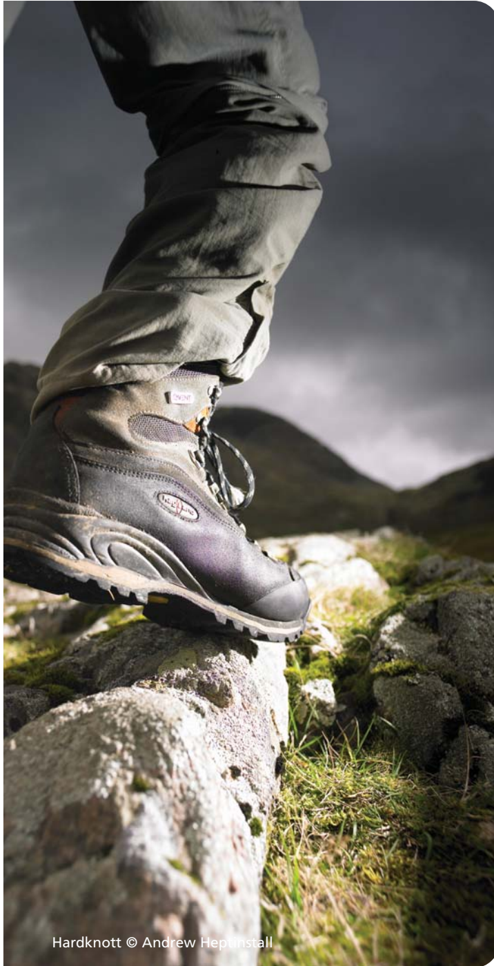
Hardknott